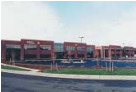
Park Place Center in Vancouver, Washington

The Park Place Center offices in Vancouver, our largest project to date, hit 96% occupancy this summer as Bonneville Power leased the majority of the remaining available space. This two-building, 54,000 sf, Class A office project is a shining example of the advantages of Design/Build. Originally conceived as a wood-framed Class B project, the Joseph Hughes Construction, Inc. Design/Build Team was able to deliver a Class A development for much less than the owner anticipated. The result is an eye-catching professional project whose exceptionally competitive rents assured quick lease-up.