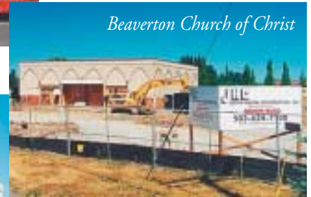
Beaverton Church of Christ