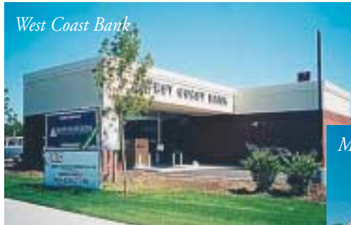
West Coast Bank