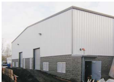
Above left: The 12,500-square-foot Lacamas Laboratories Building #7 will provide much-needed room for the company to grow. Above right: Chin's Import Export Company, Inc. occupied its new home in the Rivergate Industrial District in Portland, Oregon, when we completed this 20,000-square-foot, design-build, tilt-up concrete facility for them in December.