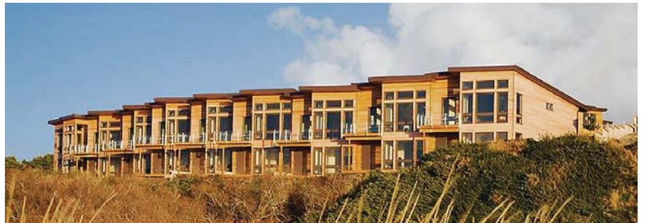
The Colony at Bandon Cove was ready for occupancy this winter as crews finished up this 18-unit condominium development in Bandon, Oregon. Designed by Myhre Group Architects of Portland and developed by the Bandon Land Development Group, LLC, this project is positioned to provide a luxurious housing alternative for people drawn to the area by the internationally-acclaimed Bandon Dunes golf courses.