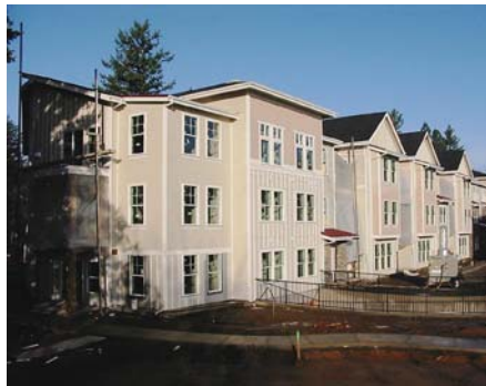
Above left: The Quail Wood development in Gresham, Oregon, is now complete and ready for occupancy. The project features secure parking under the building and 30 elevator-served, single-level, luxury condominiums. Above right: The front entries of Cascade View Condominiums leave the visitor unprepared for the spectacular views of the river and mountains that are visible from most of the 25 units.