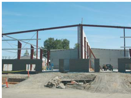
Lamas Laboratories Building 7 takes shape as iron workers bolt the red-iron together in September. Meeting the needs of numerous special requirements (including explosion proofing) challenged the entire team to bring this 12,500-square-foot building to life. The JHC/CIDA/Lamas Laboratories team completed the project this fall.